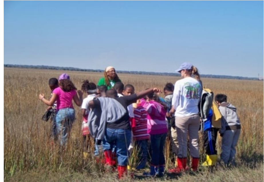
Ecology education for K-6 th grade in Chatham County