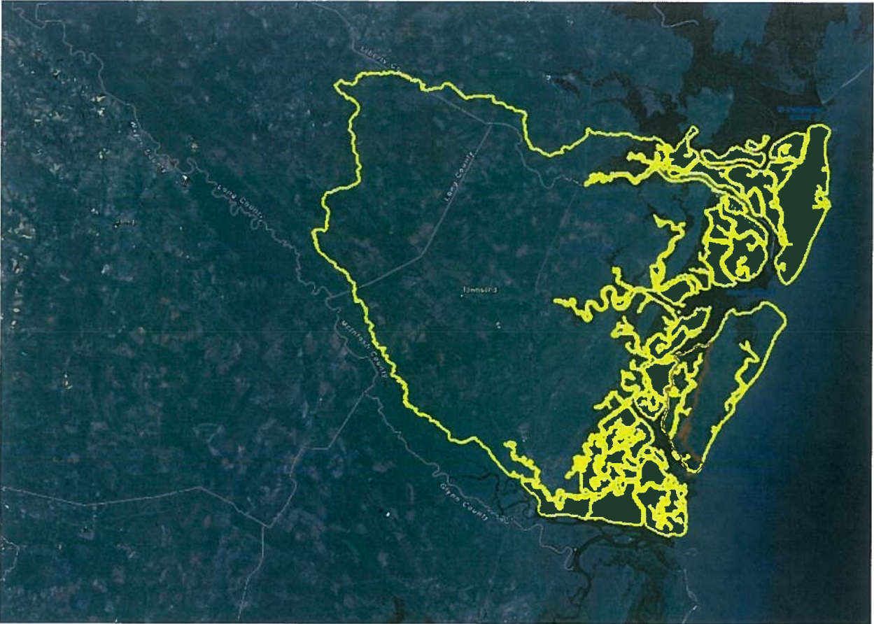
Figure 2: SINERR Targeted Watershed (1999)