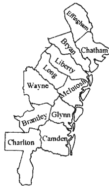
Figure 1. Geographic Extent of Georgia's Area for CELCP

The Coastal Management Program defined area contains all of the tidally influenced coastal and estuarine waters of the State, except as excluded above, and encompasses the priority conservation values described below. All lands as described above that are located within this area shall be eligible for the Georgia CELCP (see Figure 1.)