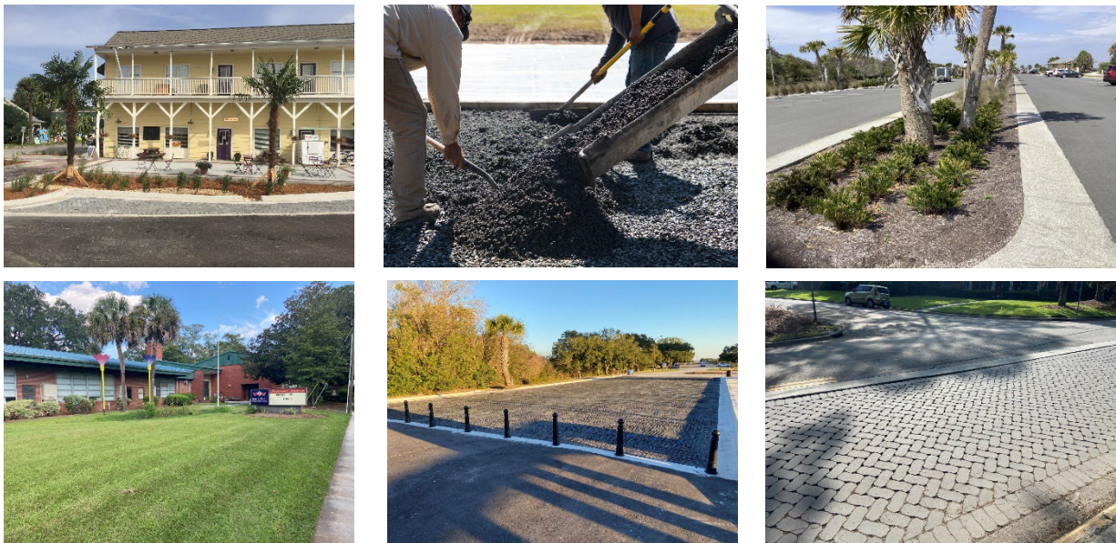
Bioinfiltration and Permeable Pavement Study Sites

Twelve sites were reviewed as part of the GI/LID Pilot Cost Study. This included seven permeable pavement systems and five bioinfiltration systems that were constructed between 2018 and 2023. For the permeable pavement sites, there were four with permeable interlocking concrete pavement (PICP), two with pervious concrete, and one with plastic grid pavers. The surface area of these projects ranged from 1,312 to 15,885 square feet (SF), and the median area was 3,942 SF. For the bioinfiltration sites, there were four bioretention systems and one wet enhanced swale. The surface area of these projects ranged from 944 to 9,557 SF, and the median area was 2,400 SF.