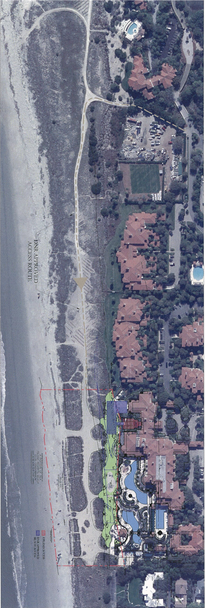
AERIAL TAKEN 3/8/2016