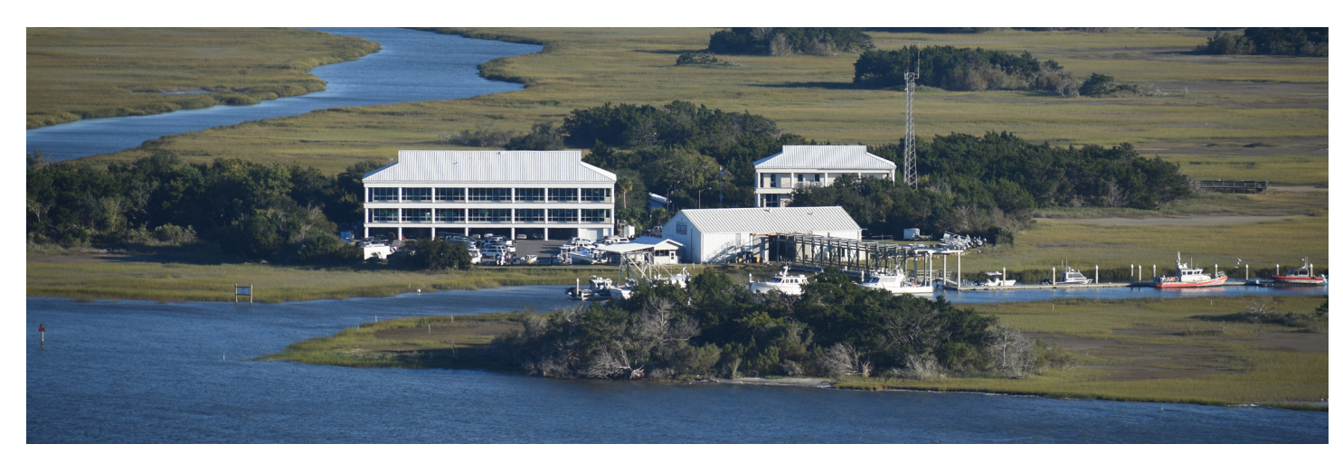
The Coastal Resources Division of the Georgia Department of Natural Resources, headquartered above in Brunswick, is committed to balancing development and protection of the coast's natural assets, socio-cultural heritage and recreational resources for the benefit of present and future generations.