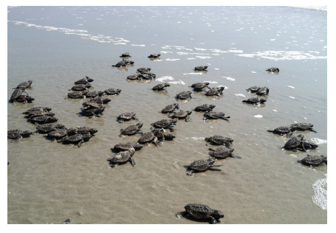
Loggerhead sea turtle hatchlings enter the ocean.