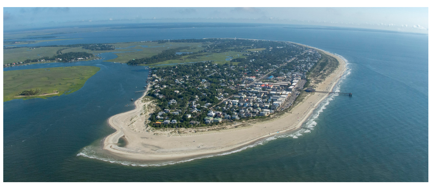
Tybee Island is one of Georgia's 14 barrier islands along its 105-mile coastline.

The vast coastal marshlands, tidal waterways, and barrier island beaches are irreplaceable treasures delivering ecological and human benefits ranging from seafood to hurricane protection. To protect them, the Division administers the Coastal Marshlands and Shore Protection acts, issues revocable licenses for waterbottoms, and coordinates with other state and federal agencies to implement sound regulatory policy. Since 1997, many of these functions have been carried out by the Georgia Coastal Management Program, a partnership with the federal government and a mandate from the state legislature.