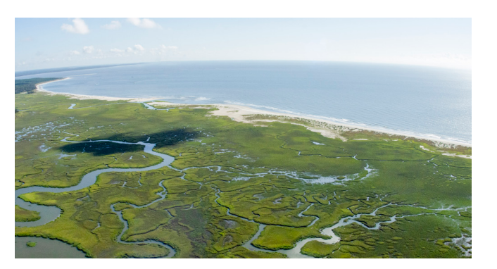
Coastal wetlands, like those seen here, filter pollutants as water runs downstream, which improve water quality.

Marshes, wetlands, and barrier islands make up the diverse habitats of Coastal Georgia. The region is rich in abundant wildlife like sea turtles, fishes, shellfish, birds, and mammals. Recreational opportunities abound, such as boating, fishing, bird watching, kayaking, and swimming. Protecting the ecosystems and their inhabitants helps support not only recreational opportunities, but also the local economy, seafood industry and tourism.