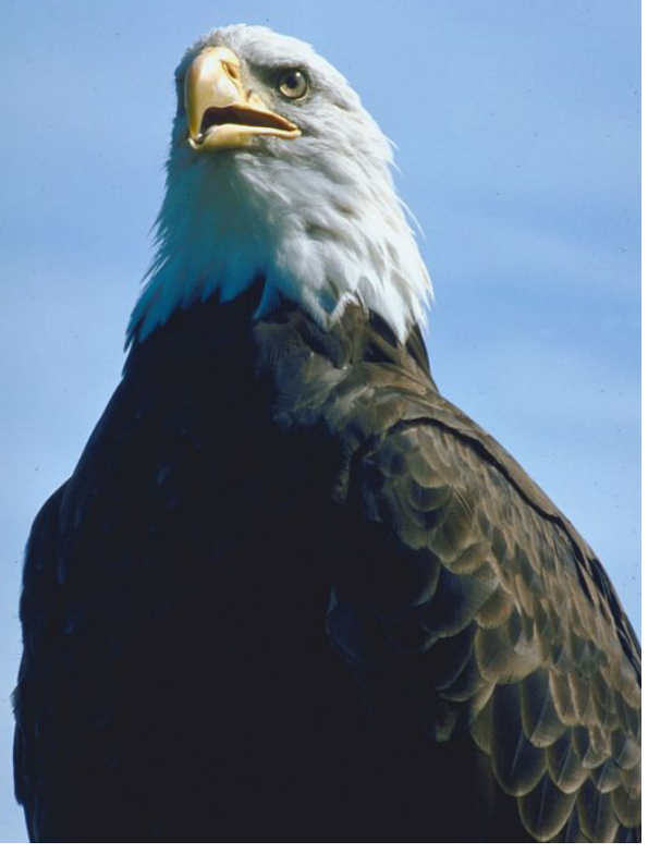
A bald eagle (Haliaeetus leucocephalus) is seen perched.

expected. Some had dead eaglets. Others were missing young that usually would not have left the nest by that time. The carcasses of three bald eagles collected on the coast in February and March tested positive for highly pathogenic avian influenza virus (HPAIV). It's likely some eagles were infected by preying or scavenging on dead or sick waterfowl that often gather in large rafts in coastal waters during winter.