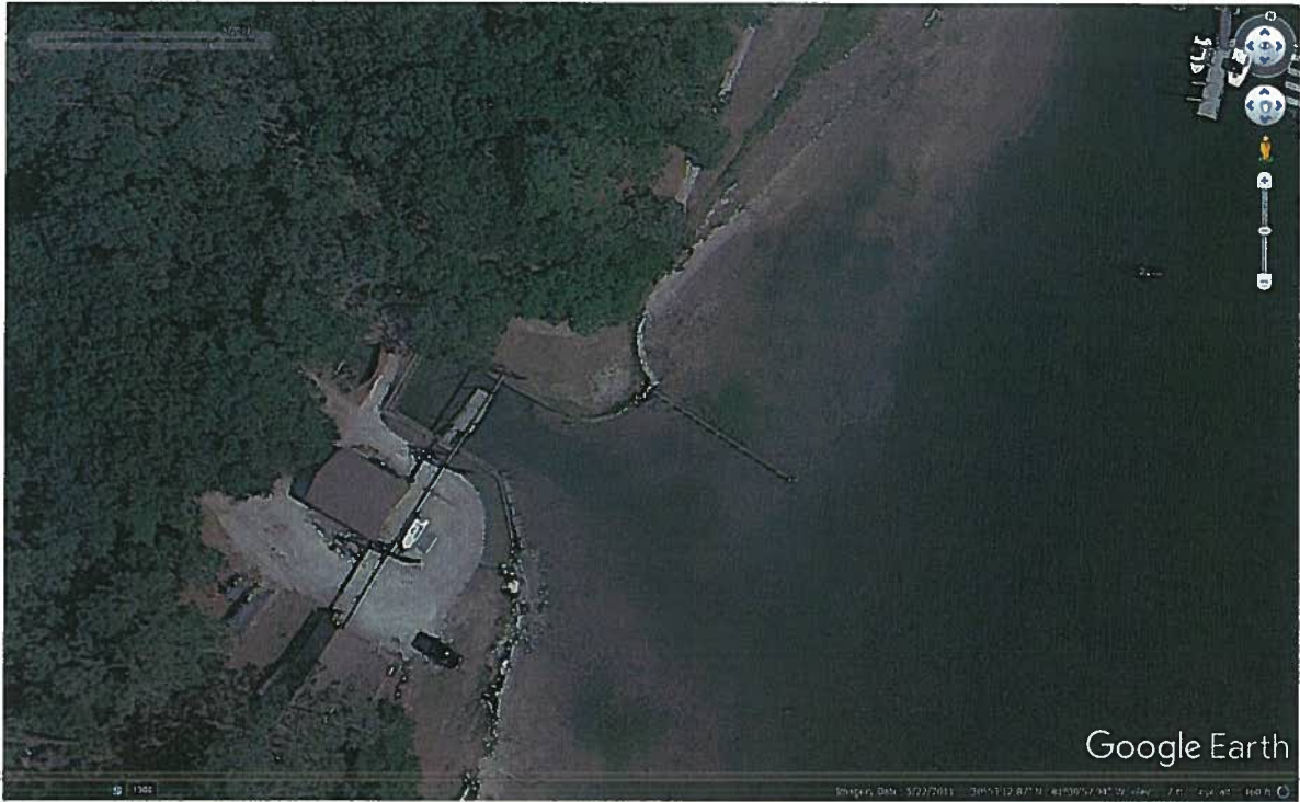
Figure 1: Aerial View of Haul Out Slip at Medium Tide