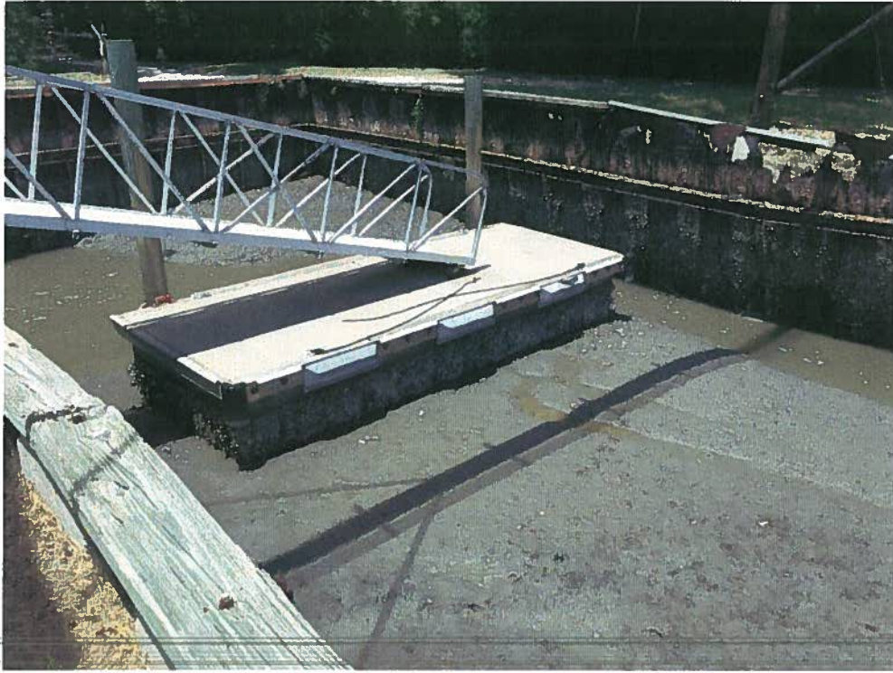
Figure 7: Haul Out Slip