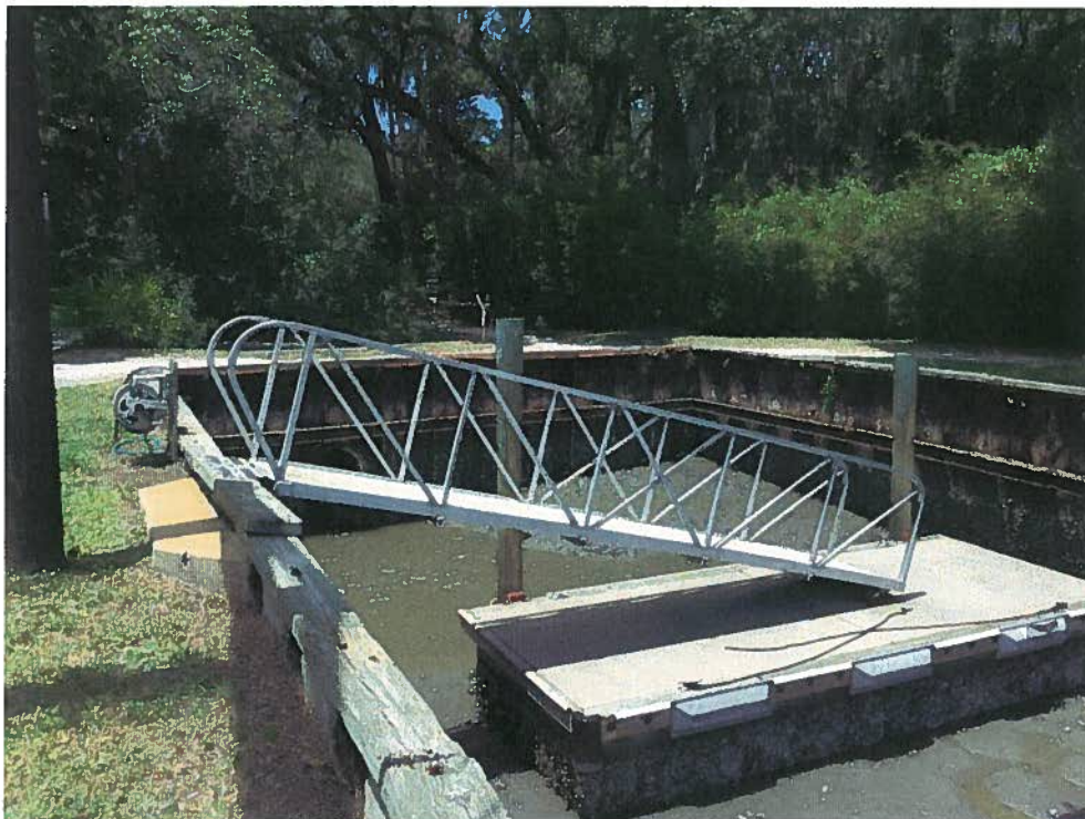
Figure 6: Haul Out Slip