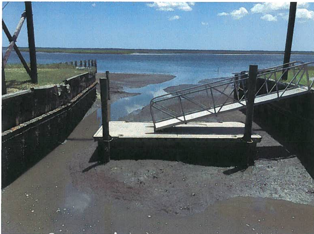
Figure 4: Haul Out Slip