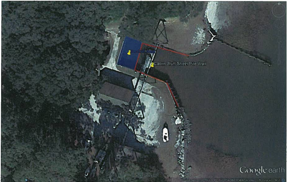
Figure 2: Aerial Image of Haul Out Slip at High Tide with basic outline of Construction Plan