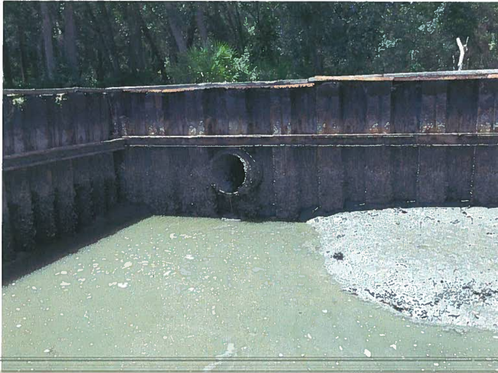
Figure 5: Drainage Pass-Through Culvert