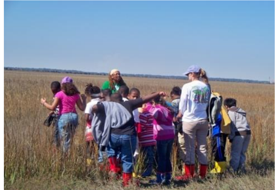
Ecology education for K-6 th grade in Chatham County