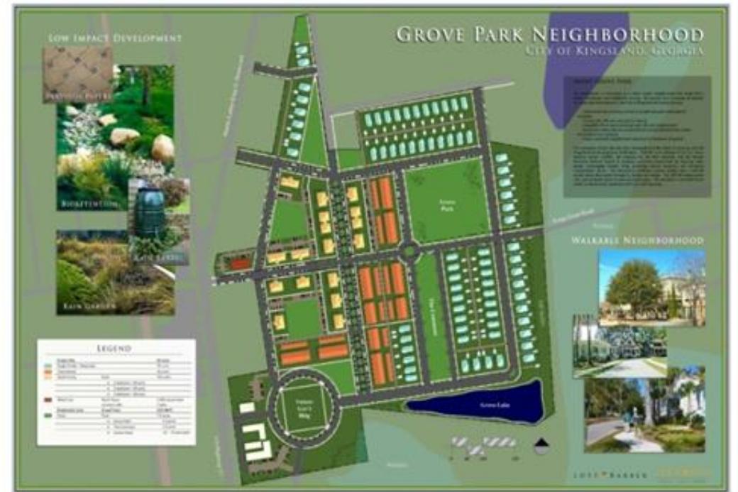
Sustainable Development Planning in Kingsland