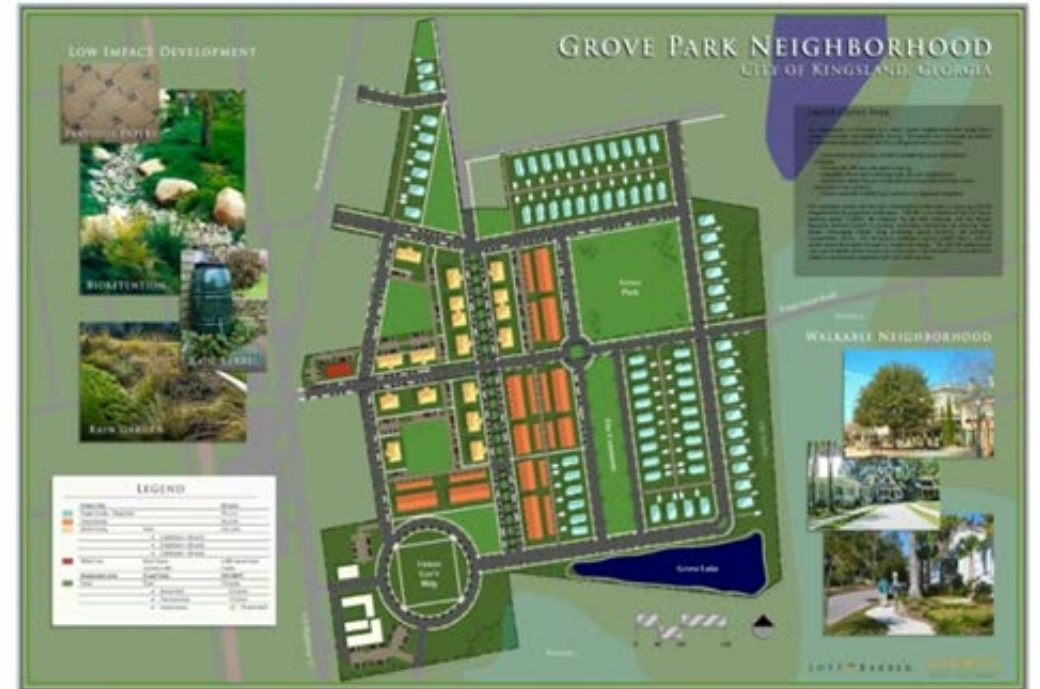
Sustainable Development Planning in Kingsland