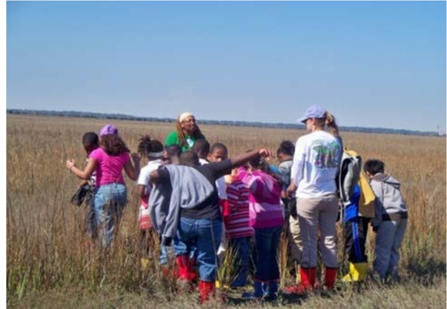
Ecology education for K-6 th grade in Chatham County