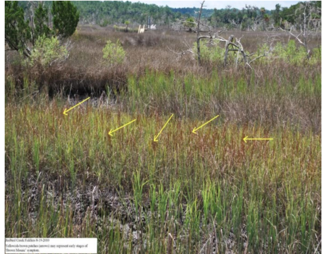
Marsh dieback research project