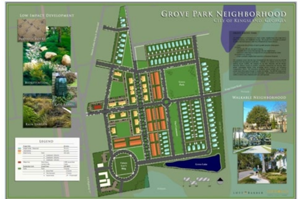
Sustainable Development Planning in Kingsland