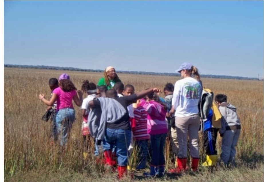
Ecology education for K-6 th grade in Chatham County