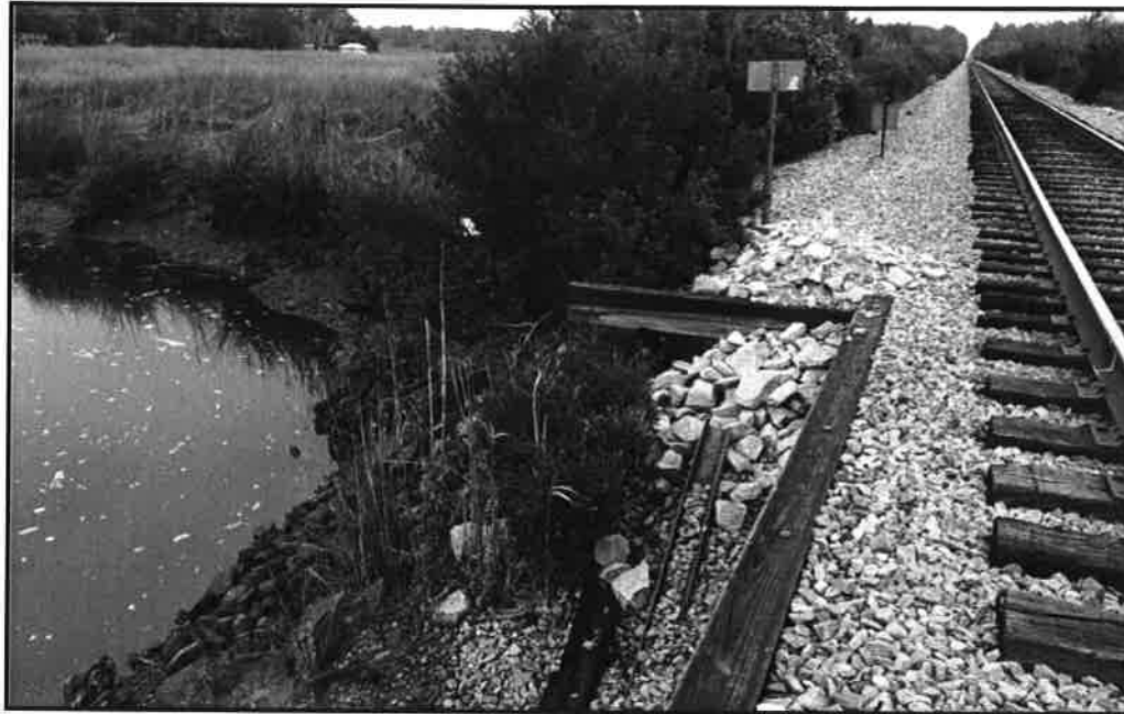
Photo 5- Facing East End Bent Zero- NE Abutment.