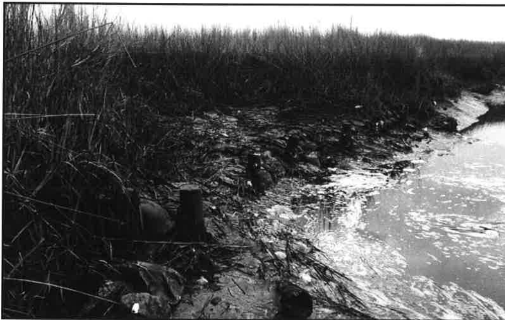
Photo 4– Facing South Along SE Bank– Piles & Remains Of Sandbags At Low Tide.