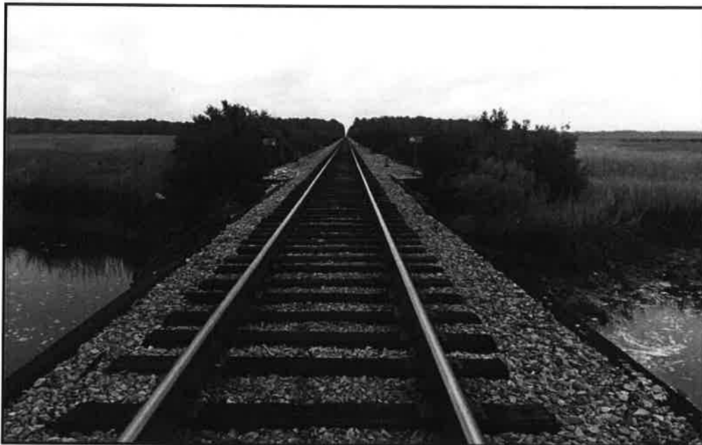
Photo 6- Facing East Along Tracks.