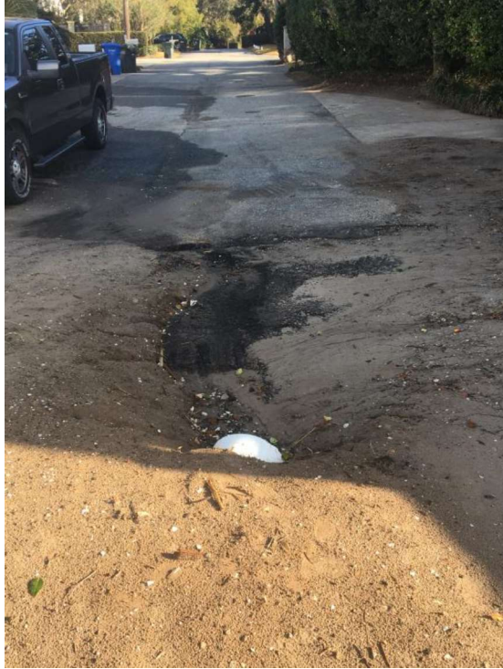
Photo 7: Existing outfall at south end of Georgia St, St. Simons facing northeast.