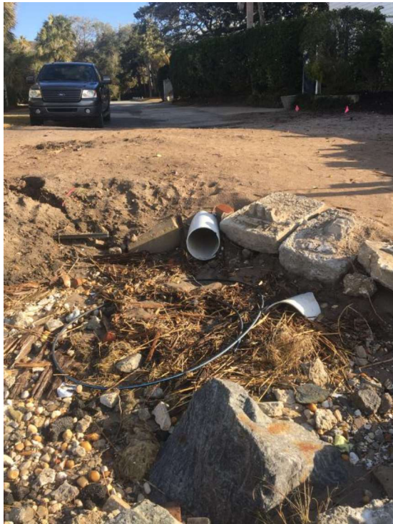
Photo 4: Existing outfall at south end of Georgia St, St. Simons facing northeast.