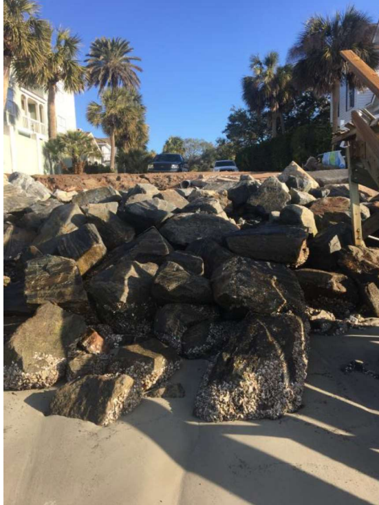
Photo 5: Existing outfall at south end of Georgia St, St. Simons facing northeast.