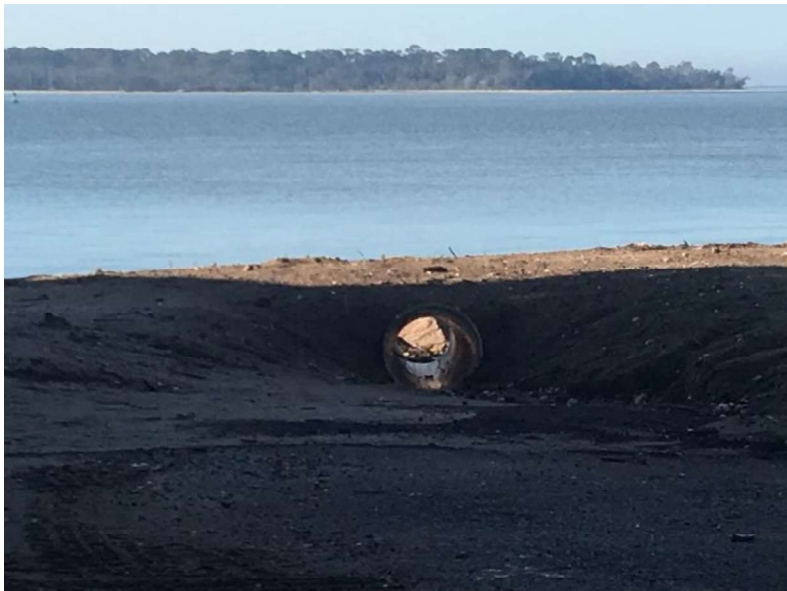
Photo 2: Existing outfall at south end of Georgia St, St. Simons facing southwest. Jekyll Island is across the waterway (St. Simons Sound).