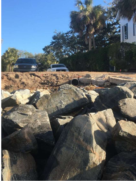
Photo 1: Existing outfall at south end of Georgia St, St. Simons facing northeast.