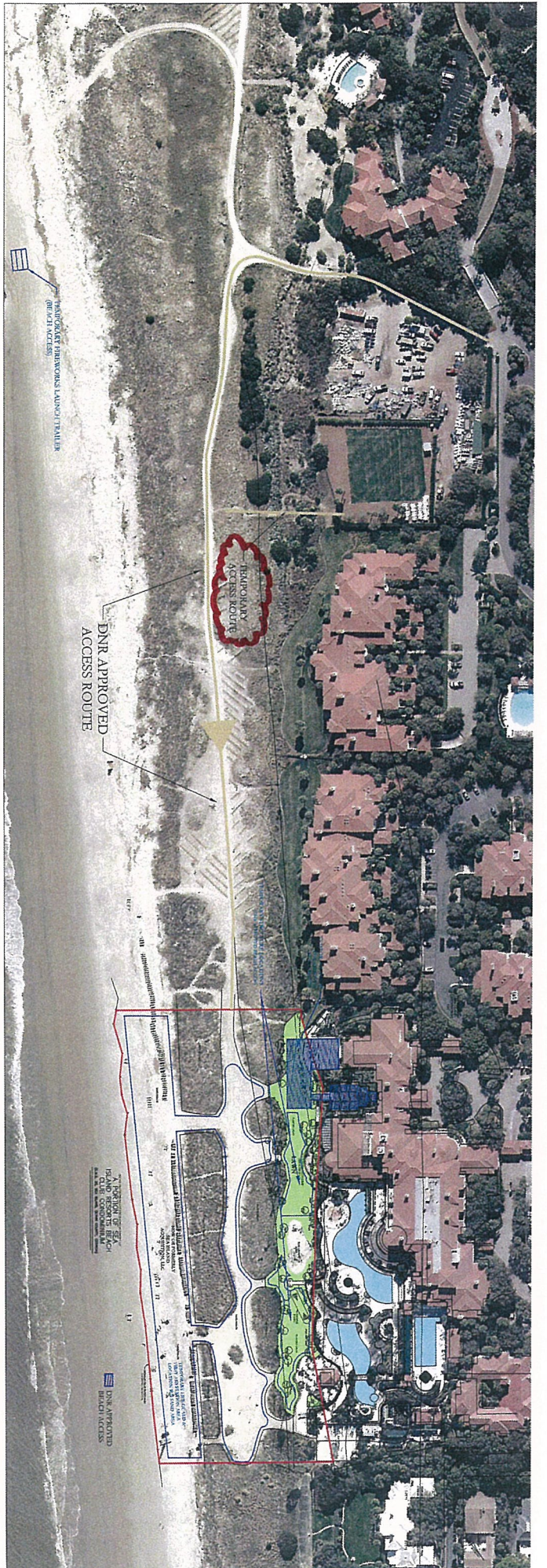
AERIAL TAKEN 3/8/2016

DNR LETTER OF PERMISSION (LOP) EXHIBIT B Sea Island Beach Club SCALE: 1" = 150'