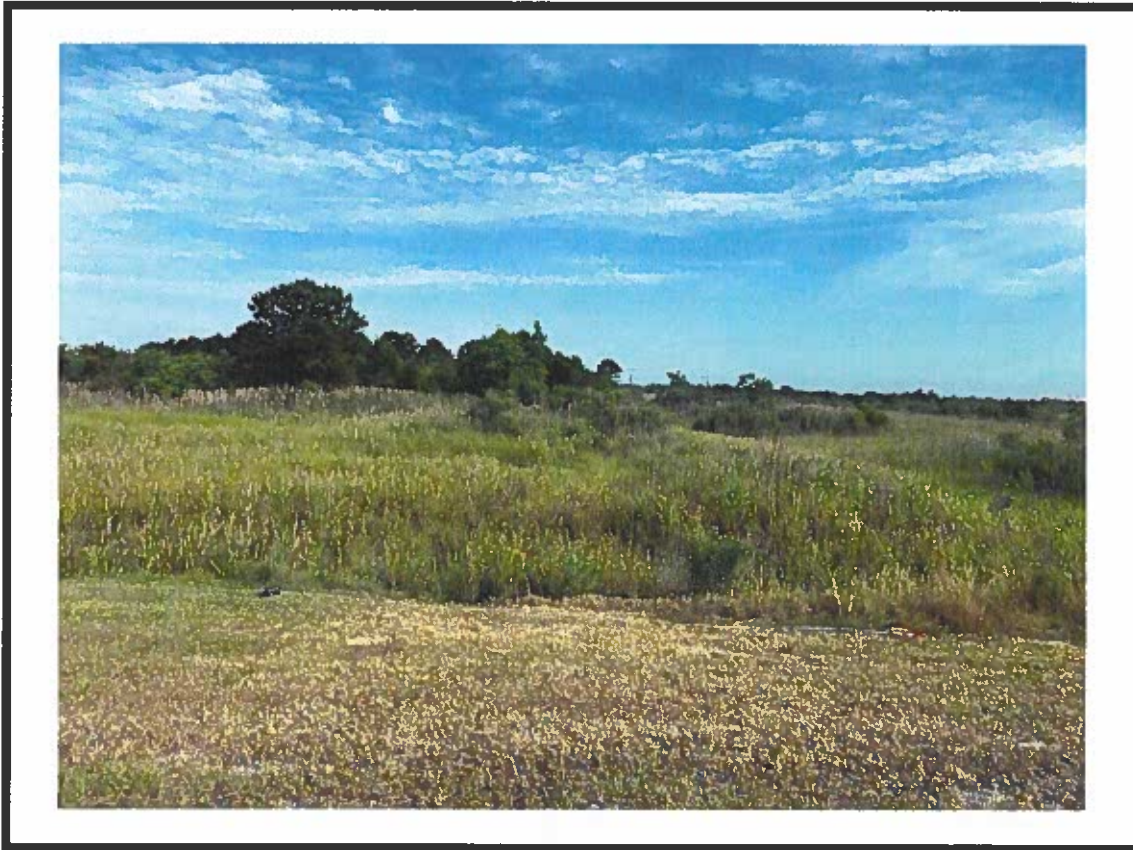
Photo 5: Facing north at roadside ditch with Confined Disposal Facility (CDF) in background