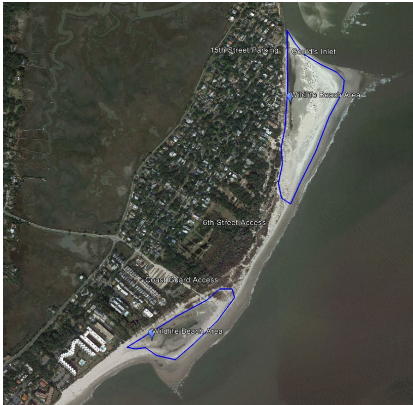
Figure 2. Proposed area for sign installation on the beach above the tide line.