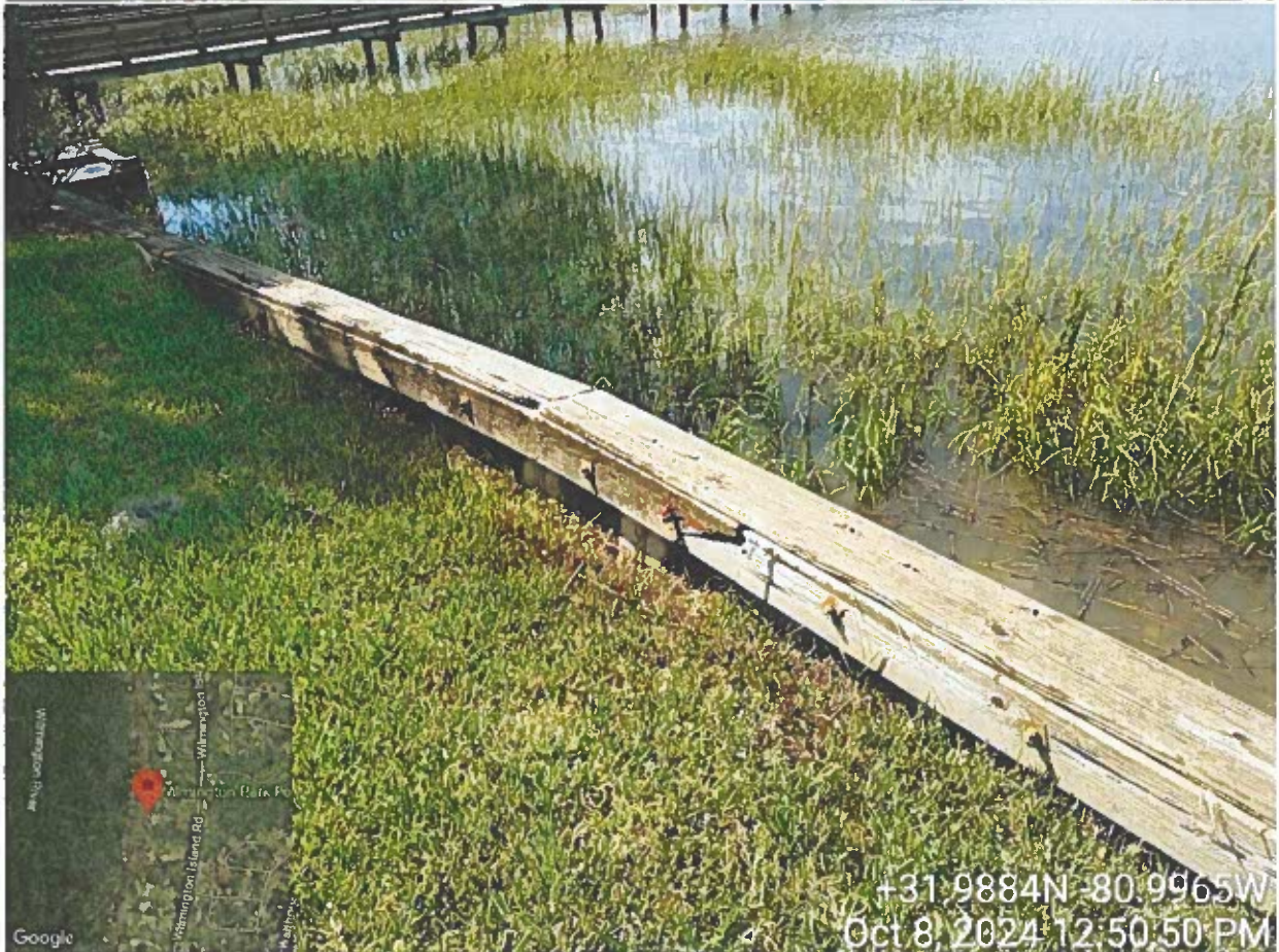
Site Visit – 1218 Wilmington Island Road – Manocha – LOP Replace Bulkhead – by Cheyenne Osborne