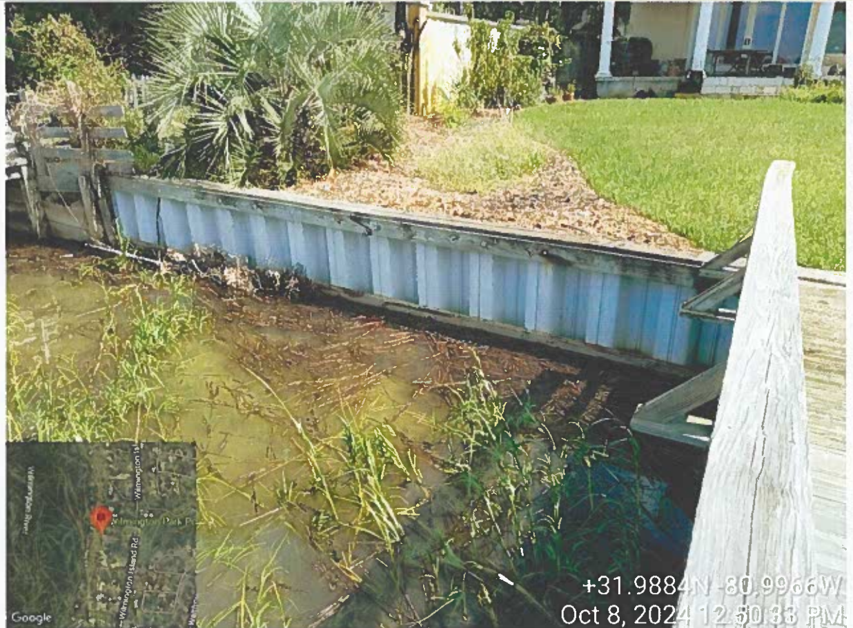
Site Visit – 1218 Wilmington Island Road – Manocha – LOP Replace Bulkhead – by Cheyenne Osborne