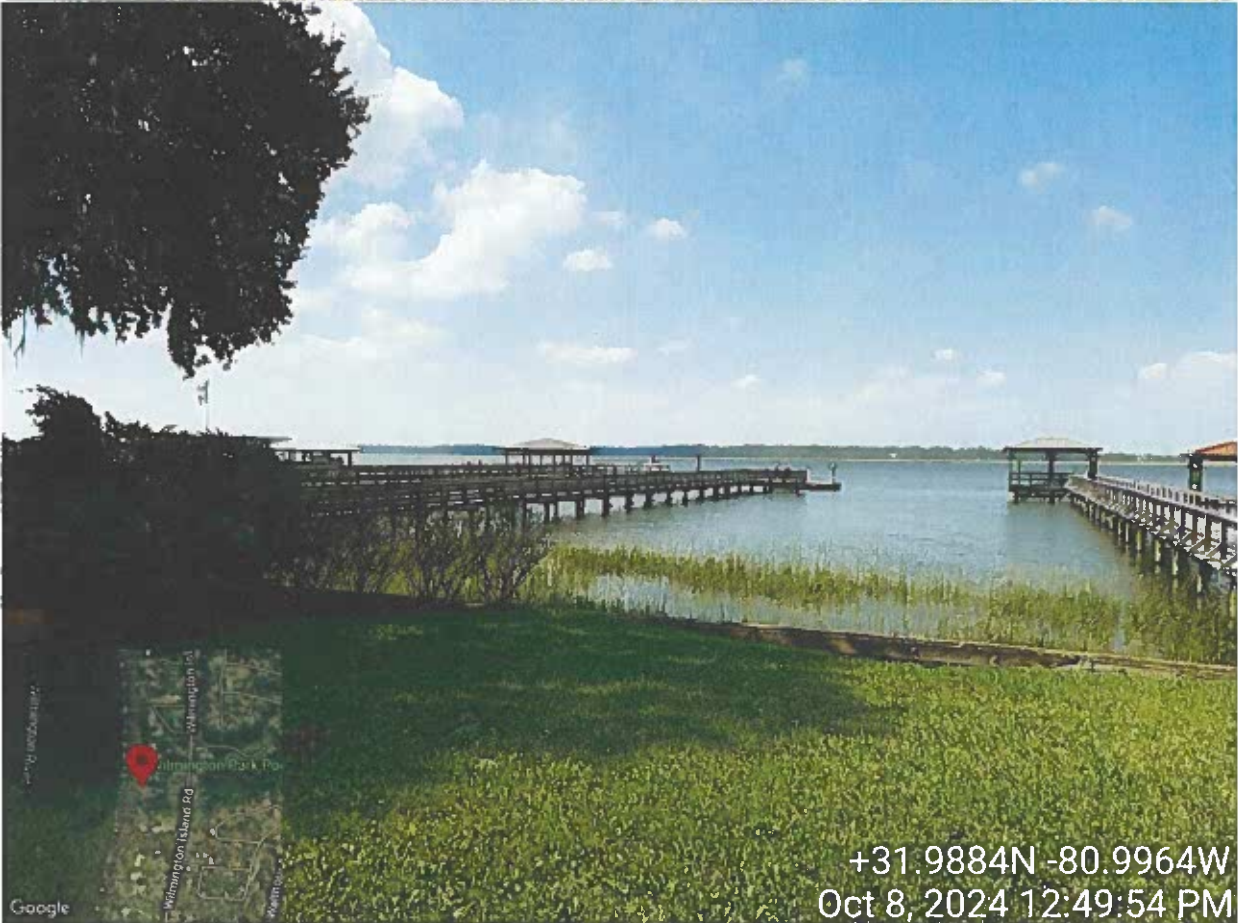
Site Visit – 1218 Wilmington Island Road – Manocha – LOP Replace Bulkhead – by Cheyenne Osborne