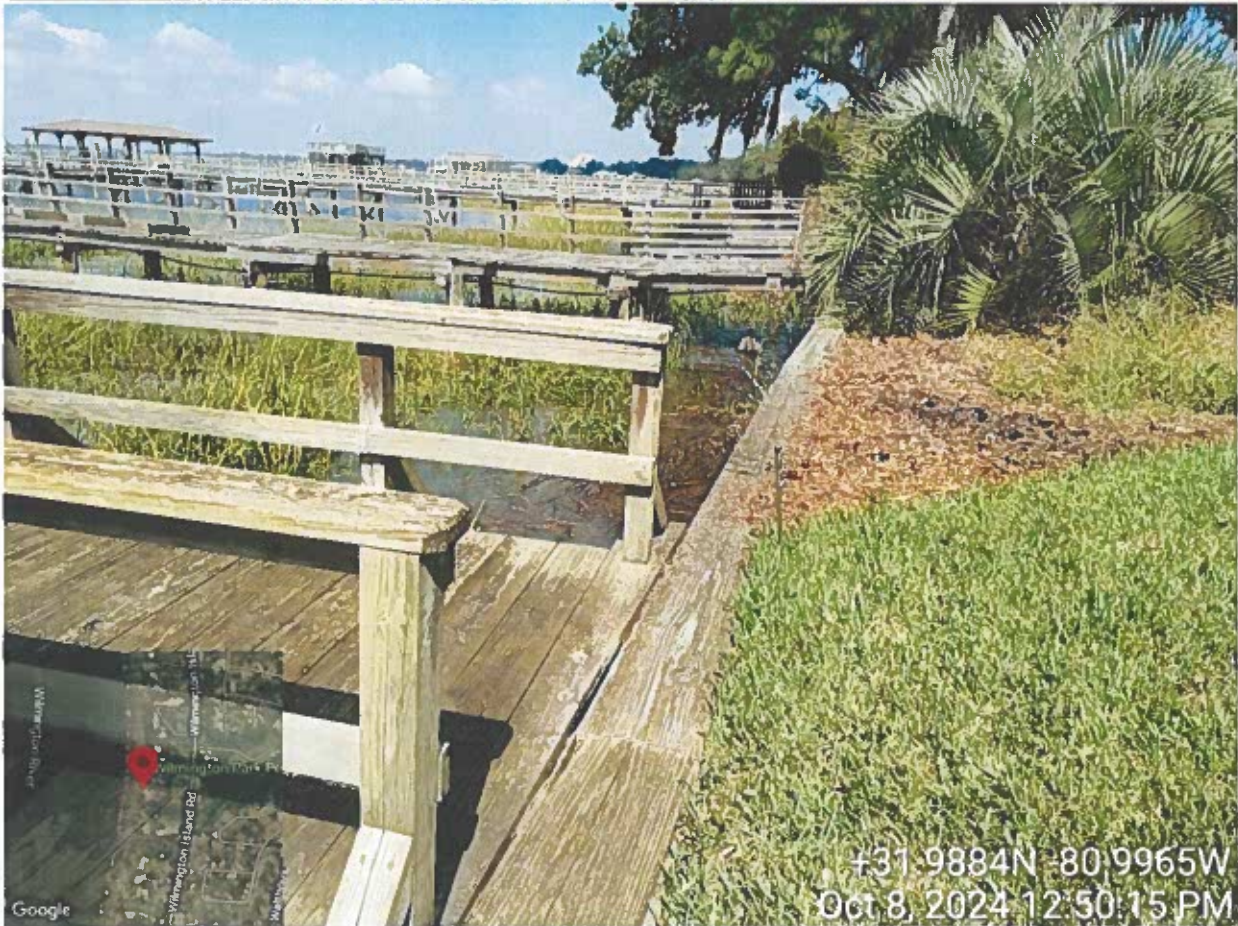
Site Visit – 1218 Wilmington Island Road – Manocha – LOP Replace Bulkhead – by Cheyenne Osborne