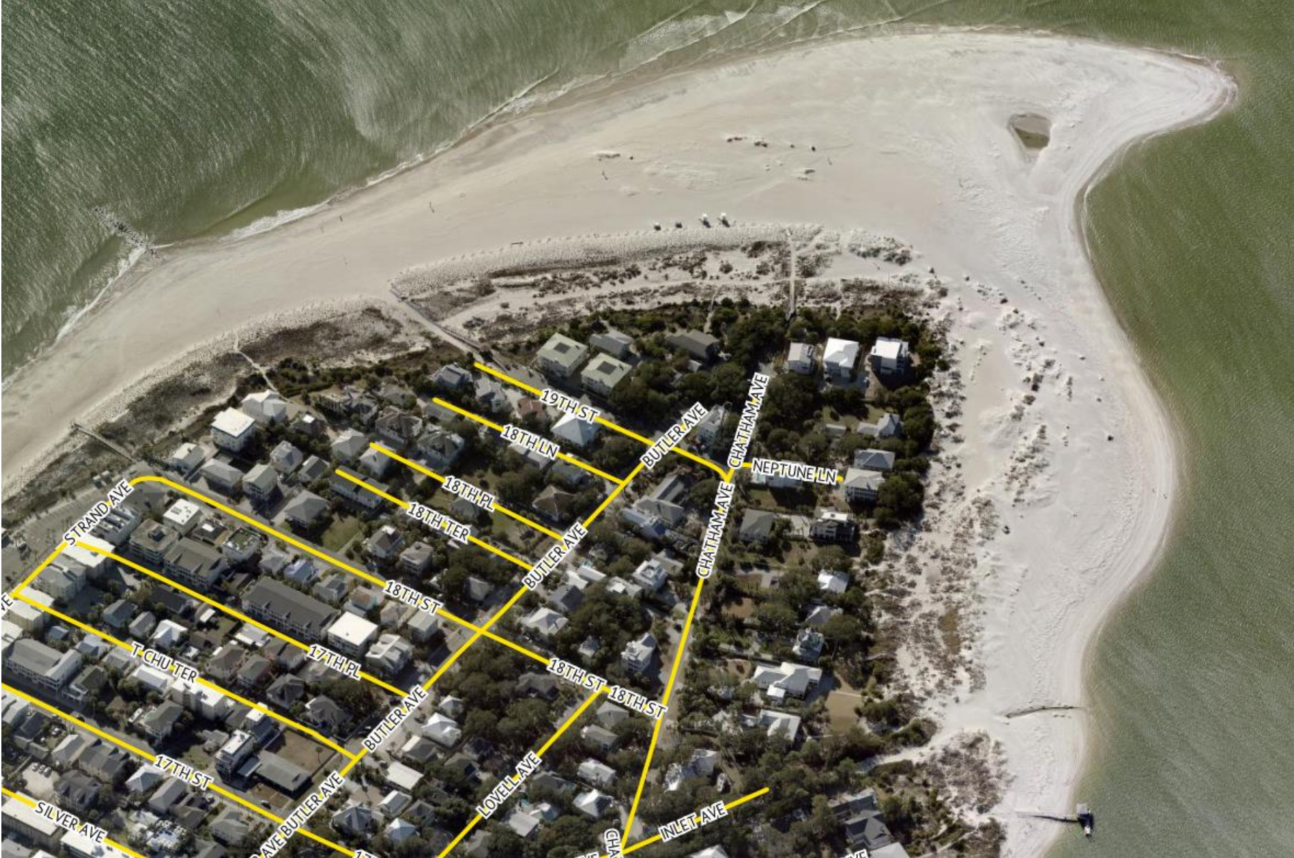
1927 A Chatham Avenue Atlantic Ocean, Tybee Island, Chatham