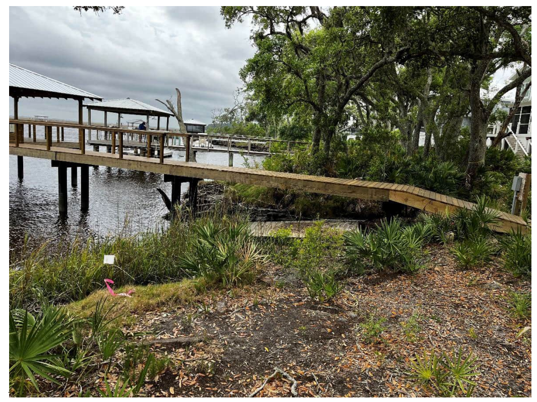
Photo 1: DNR and CE line within Lot 1, wooden walkway to private dock