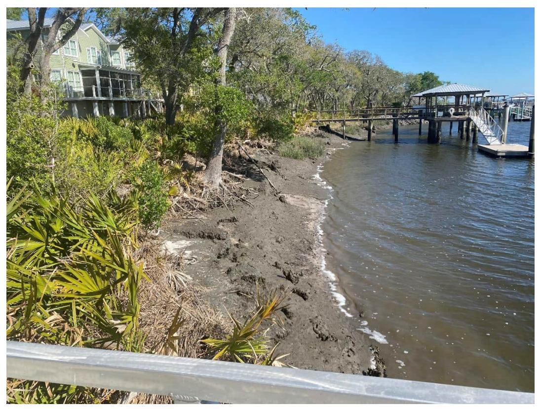
Photo 1: DNR and CE line within Lot 3, facing north from residential dock