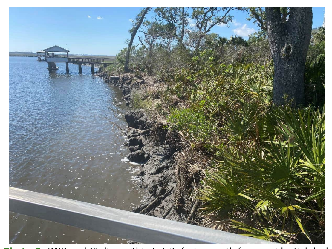
Photo 2: DNR and CE line within Lot 3, facing south from residential dock