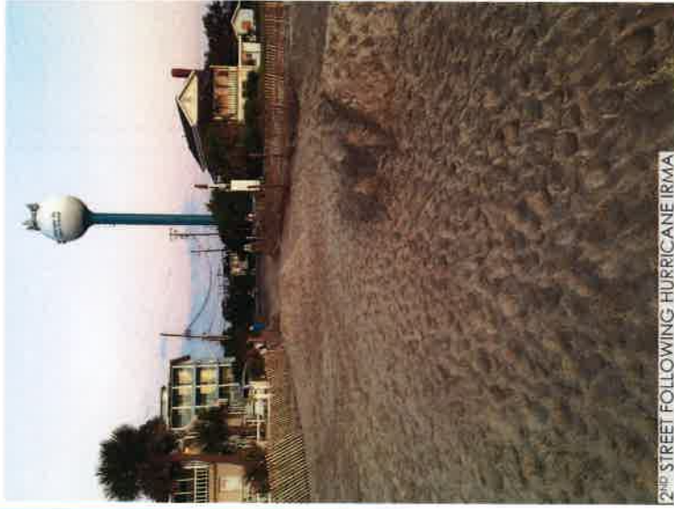
2 ND STREET FOLLOWING HURRICANE IRMA