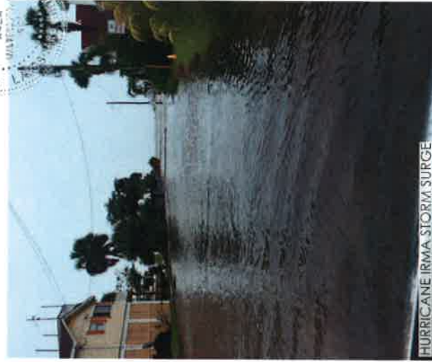
HURRICANE IRMA STORM SURGE