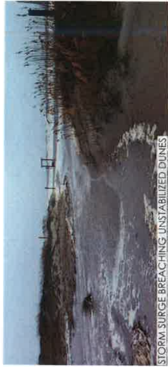
STORM SURGE BREACHING UNSTABILIZED DUNES