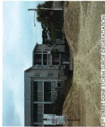
3 RD STREET DUNE STORM SURGE DEGRADATION!