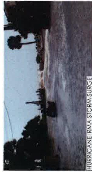
HURRICANE IRMA STORM SURGE