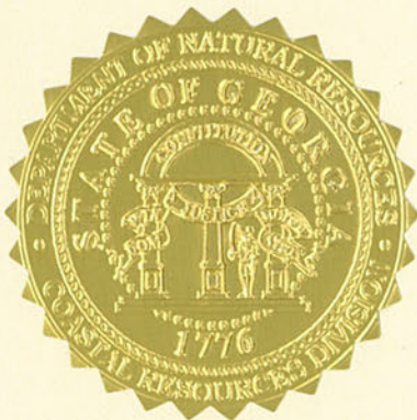
GOVERNOR State of Georgia