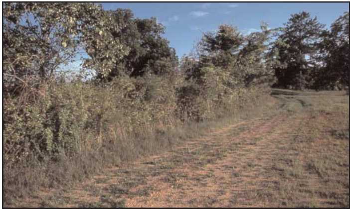
Dense thickets provide critical protective cover for rabbits.

Clearcuts and pine regeneration areas less than seven years old provide good rabbit habitat. These areas usually contain a mixture of herbaceous plants, thickets and brush-piles until the trees begin to shade out the understory. Planting pine seedlings on an 8' by 12' or wider spacing will delay crown closure and lengthen the period of good rabbit habitat.