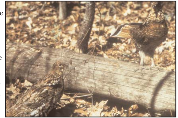
Adult male grouse spend much of their time near drumming logs.

Georgia grouse populations are usually 3-4 times lower than densities reported in many northern states. Poor habitat and less nutritious foods may contribute to lower southern populations. Lack of quality habitat makes grouse more susceptible to predation.