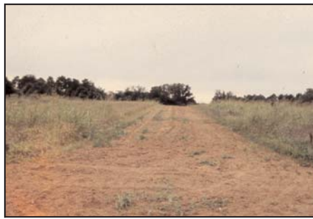
Mowing mature grain next to disked strips provides seeds on bare ground which is attractive to doves.

Doves do not stay in one place indefinitely, but do tend to return to the same area each season, with the larger concentrations occupying the most attractive places. While good dove management consists primarily of regulating the harvest over a large geographic area, local attention to the basic needs of the birds will greatly increase the chances of successful dove hunting opportunities.