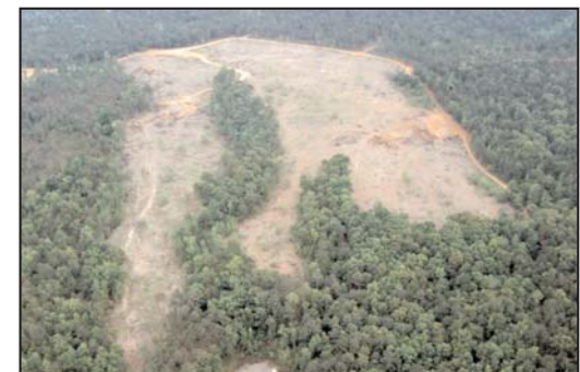
Hardwood corridors left in clearcuts greatly enhance these areas for squirrels.

The most important habitat components to provide for gray squirrels are mature, mast-producing hardwoods and large cavity-producing trees. Fox squirrel habitat includes mature, open pine forests having a variety of mast-producing trees. Most oaks and hickories require over 40 years to reach optimum mast production and cavity development. Forest management decisions, once carried out, are not quickly changed and have long-term impacts on squirrels. It is important for landowners to wisely manage their forests if the continued benefit of squirrels and other hardwood dependent wildlife is among their objectives.